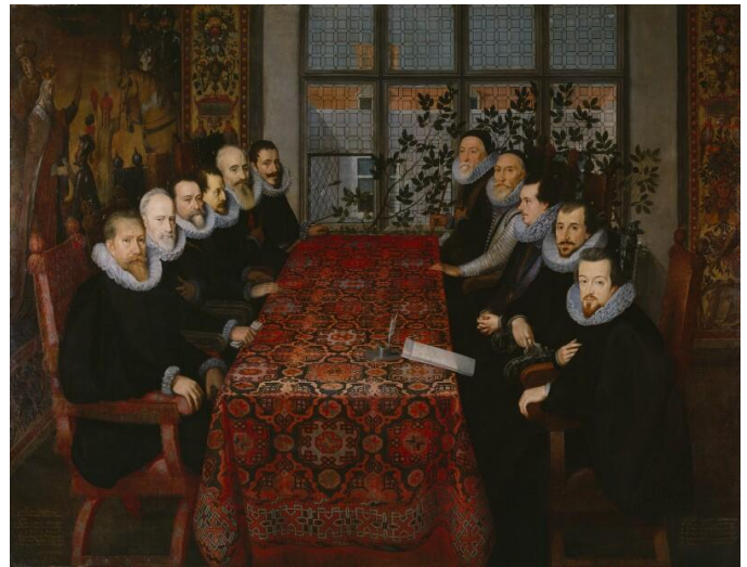
NPG 665 The Somerset House Conference, 1604

Information from The Dinner Book of the London Drapers' Company 1564-1602 , ed. by Sarah A. Milne (London: London Record Society, 2019) pp. 23; 79.